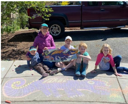
Neighbors draw for fun