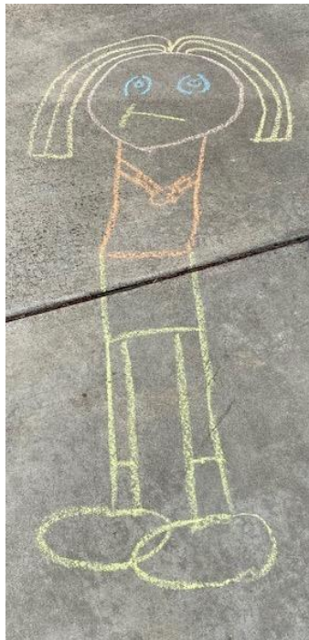
Hi there neighbor!