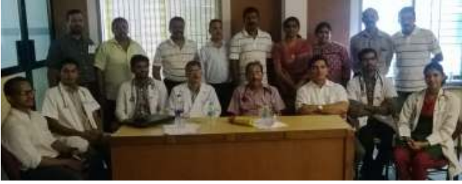
Doctors in the camp (sitting) along with Coordinators (standing) at the Cochin CHD Camp on 12 Jan 2014