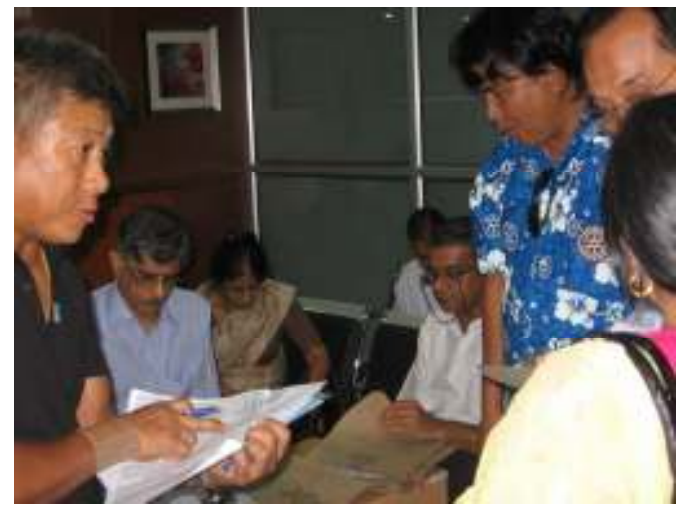
The camp in progress

Rotary Club building at Imphal where Gift of Life screening camp was held on 12 August 2012