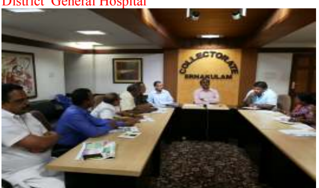
Gift of Life' press conference at District Headquarters on 2 January 2014

Organised by Rotary Club of Cochin North in association with R.I. Dist 3201, District Collectorate, District General Hospital