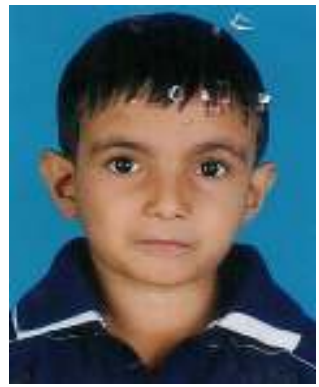
He underwent surgery on 10 March 2014. After recuperation, he was discharged on 18 March 2014