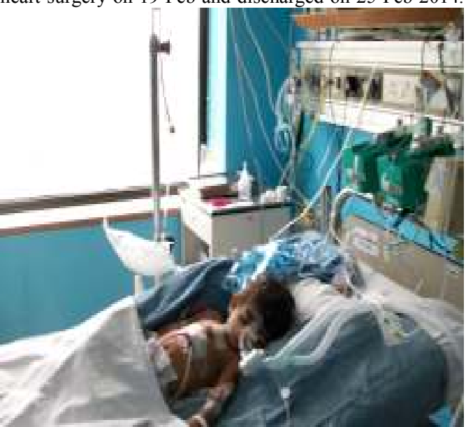
Avani Krishna, 8 months, female, Edapally was admitted to Escorts hospital on 25 Feb 2014.