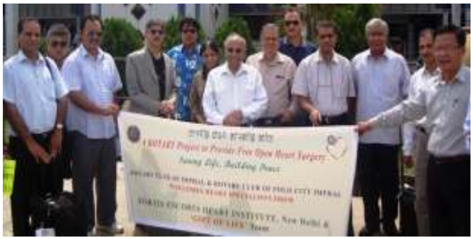
Rotary volunteers at Imphal along with Doctors team from Fortis Escorts Heart Institute, New Delhi

On 6<sup>th</sup> May 2014, children of Manipur who underwent open heart surgery under Gift of Life program would assemble at Raj Bhawan, Imphal, Manipur to celebrate 'life'.