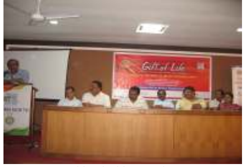
Gift of Life meeting