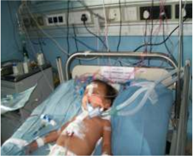
Sarita, 1 year, female referred by Rotary Club of Imphal (Manipur) has been admitted to Escorts Hospital on 31 March 2014. Sarita was operated on 3 April 2014