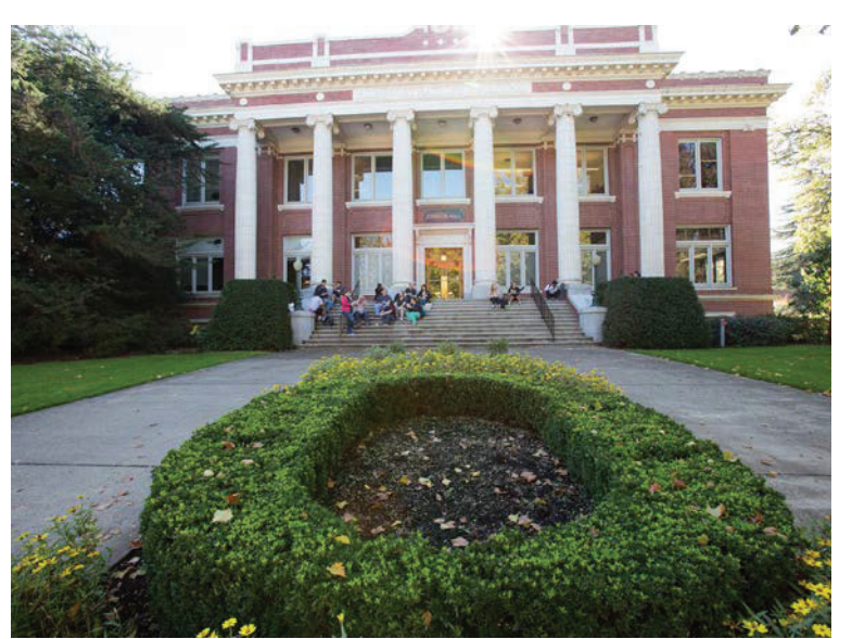
Outside of Johnson Hall, 2013.