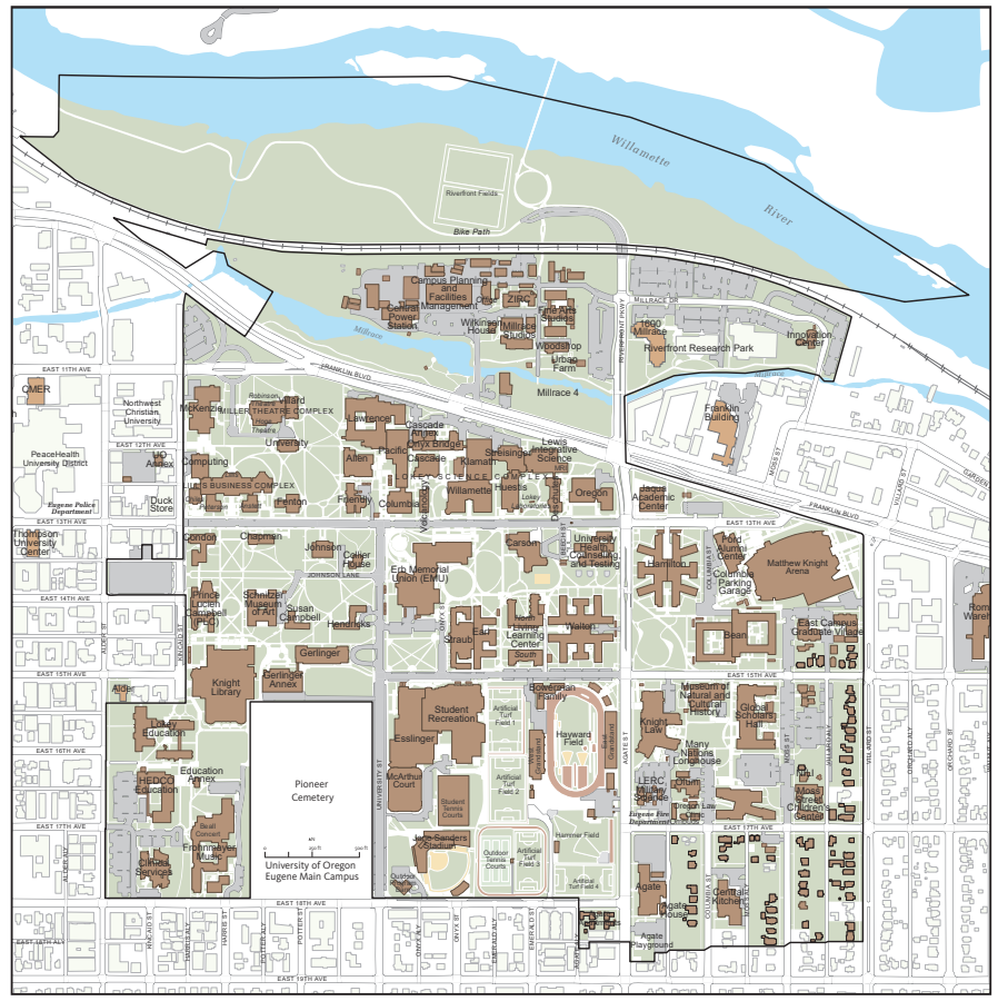
Map 1: University of Oregon Campus Boundaries

3. University-controlled Properties Properties that are fully leased and occupied by the University (e.g. properties leased from the UO Foundation) are subject to Campus Plan requirements to the degree applicable and in a manner similar to University-owned properties outside of the Campus Boundaries.