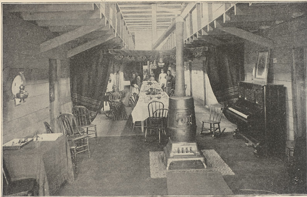
RED CROSS HOTEL, LOCUST STREET, JOHNSTOWN, PA.