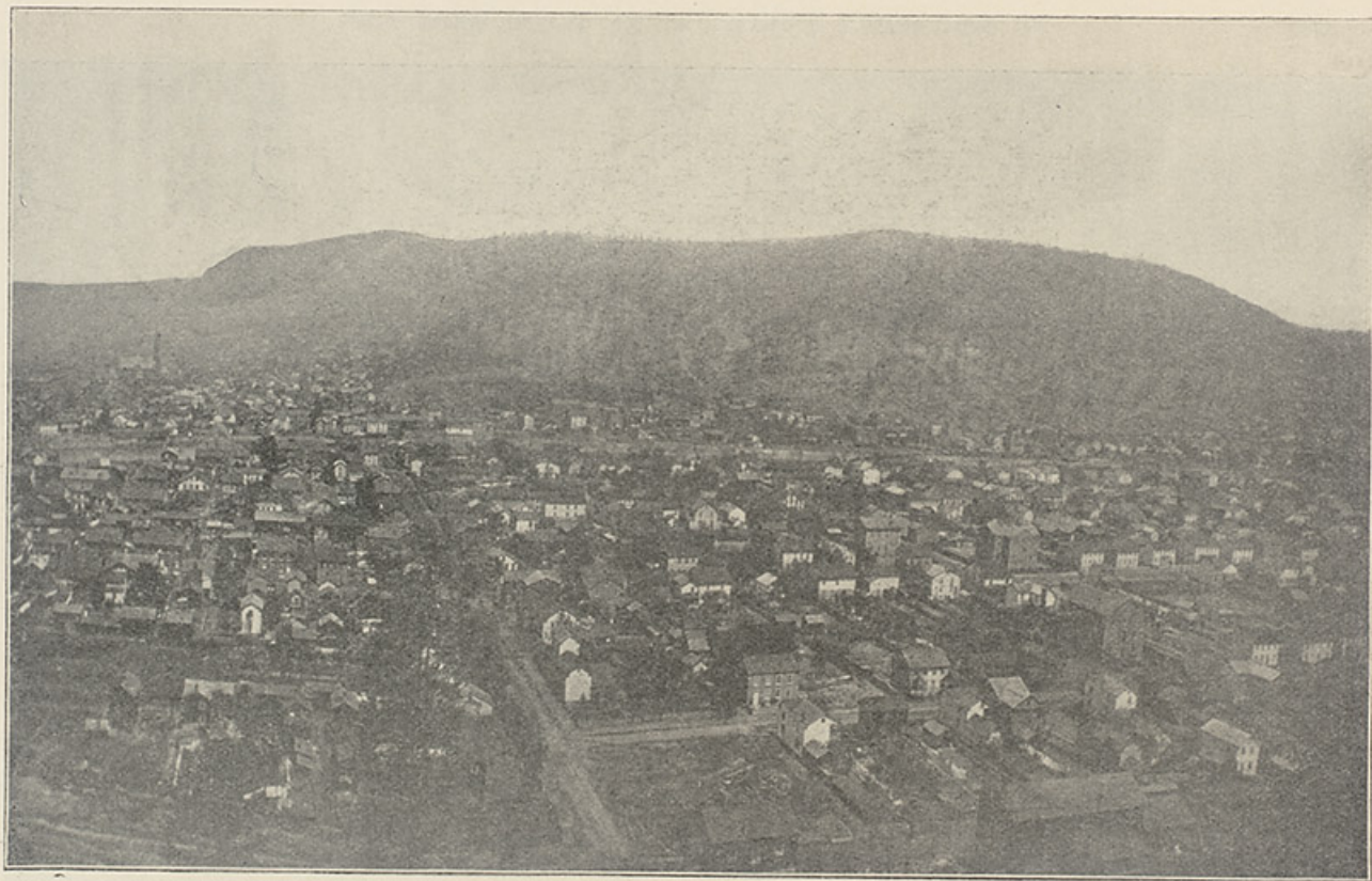
JOHNSTOWN, PA., BEFORE THE FLOOD OF 1889.