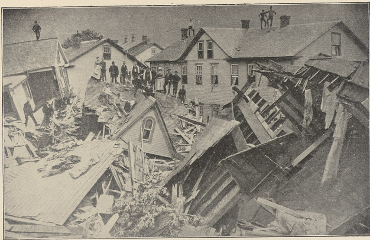
TYPICAL SCENE AFTER THE FLOOD AT JOHNSTOWN, PA., MAY 30, 1889.